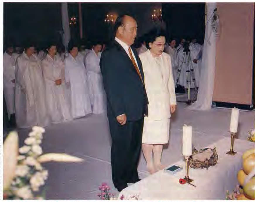
Father and Mother offer a prayer at the Day of Victory of Love celebration in the World Mission Center on January 2, 1996.

Every day we have to think about death. Today I am walking this way, but if I suddenly drop dead what will happen? Even if you drop dead in the middle of walking, as long as you are determined to win one day, you will be successful.