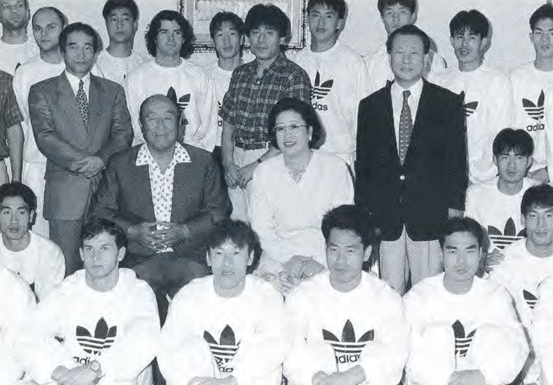
Father and Mother pose with the II Hwa soccer team on tour in Uruguay.

Small airplanes are not so expensive actually. In each country, the most beautiful and scenic areas are in the remote countryside. Therefore, if we build small landing strips in such locations and have our own privately owned resorts, people will come and visit.