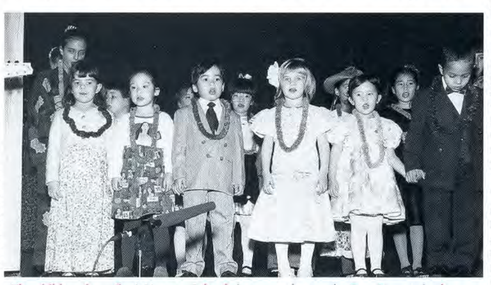
The children from Jin-A Nursery School sing several songs for True Parents in the evening's entertainment program.

Beginning in April 1993, when the Women's Federation for World Peace was established, Mother took responsibility for a three-year course which involved going around the world, separating good from evil. (Applause.) Mother spoke at forty major university campuses in Korea for the sake of separating good from evil. She then went on a forty-nation speaking