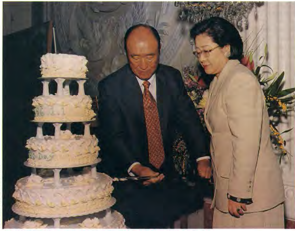
Father and Mother cut the True God's Day 1996 celebration cake.

In our life of faith the most fearful thing is becoming a leader. The leader's position is one of giving and investing, not taking from someone.